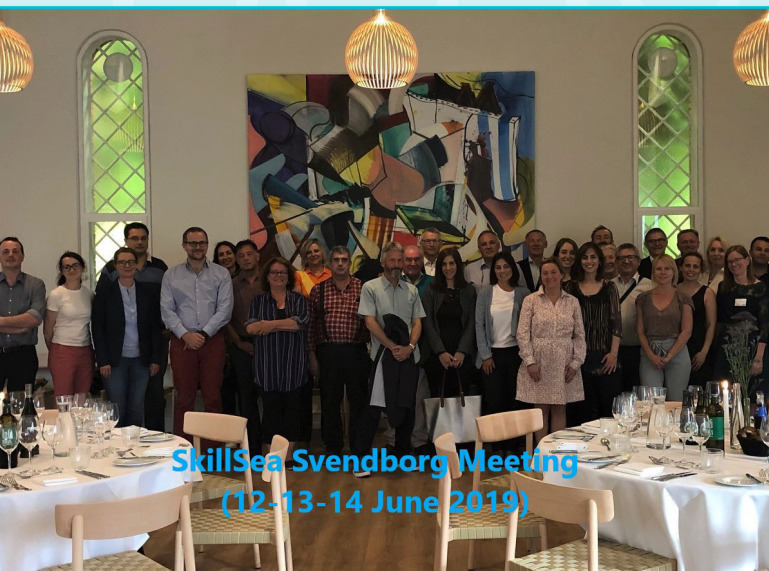
SkillSea Svendborg Meeting (12-13-14 June 2019)