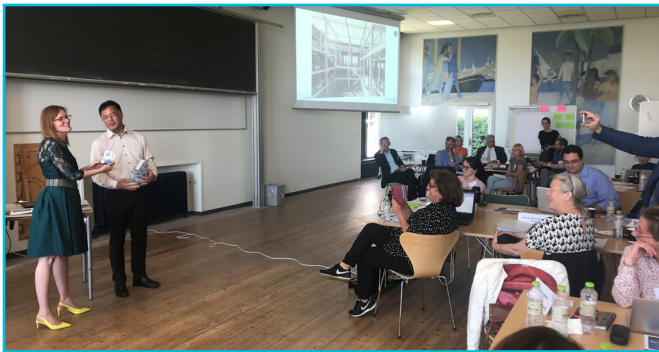
Workshop during the SkillSea consortium meeting in Svendborg

land side employees and 1149 responses from seagoing employees. A big thanks to all the partners for contributing to getting the survey distributed to potential respondents. We were very satisfied with the number of responses and the results were handed over to Rijeca for analysis and inclusion in the report. The report had thus far been drafted from preliminary results as we had those coming in since the start of October 2019. The report is now in its closing stages and we look forward to doing a final review during the Athens meeting.